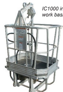
IC1000 industrial work basket