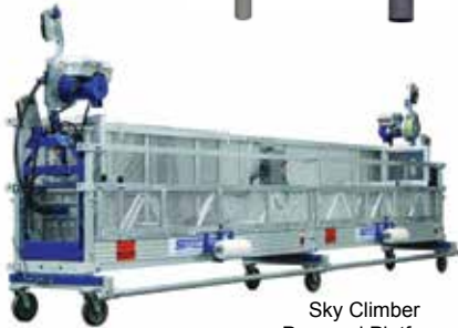
Sky Climber Powered Platform