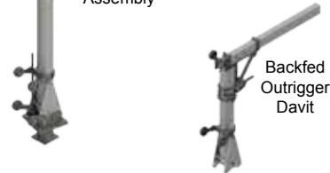
Backfed Outrigger Davit