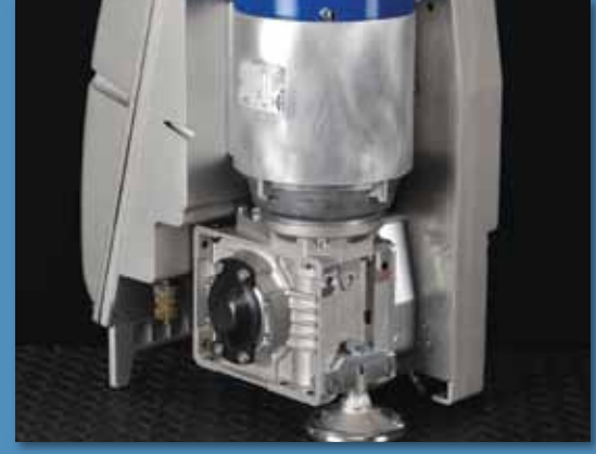
Emergency ascent handwheel, shown in stored position.

Sealed worm gearbox drives solid sheave Sits flat on work bench for easy maintenance and storage