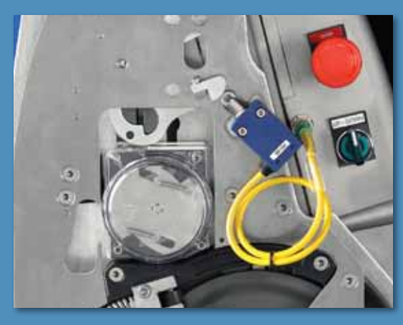
LNX has an internal over-speed device that will automatically reset by going in the upward direction.