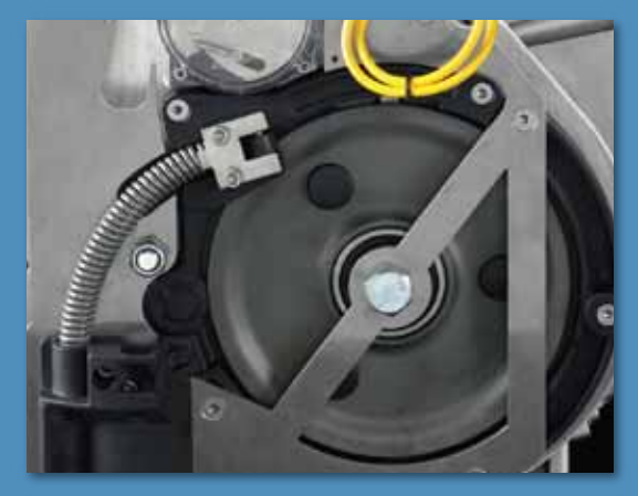
Solid sheave traction mechanism grips wire rope for ascent and descent using innovative roller system.