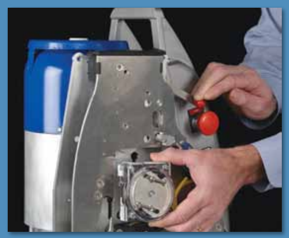
Modular design and construction. Internal Sky Lock Easy to access Side panel removes easily