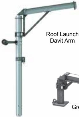
Roof Launch Davit Arm