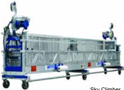
Sky Climber Powered Platform