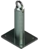
Bolted Roof Anchor