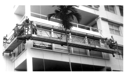
30 ft. MKD with 90° corner and 10 ft. MKD

he (MKD) Modular Knock Down work platform and MKD2 work platform systems are lightweight, sturdy, aluminum & steel platforms of modular design which utilize interconnecting components that can simply be pinned together to assemble platforms