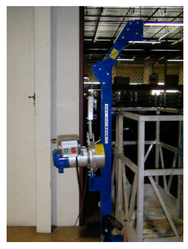
Figure 5 - Complete front view of Compact hoist mounted on Walk-Thru stirrup of MKD Work Cage. Shows routing of wire rope through stirrup and into hoist.