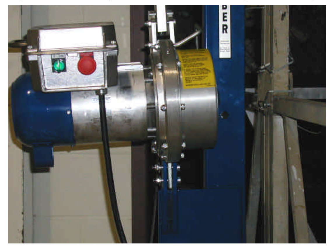
Figure 4 - Close-up front view of Compact hoist mounted on Walk-Thru stirrup of MKD Work Cage.