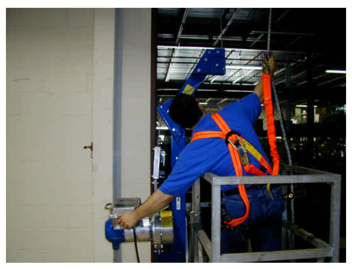
Figure 9 - Operator using the hoist controls of Compact hoist mounted on Walk-Thru stirrup of MKD Work Cage.