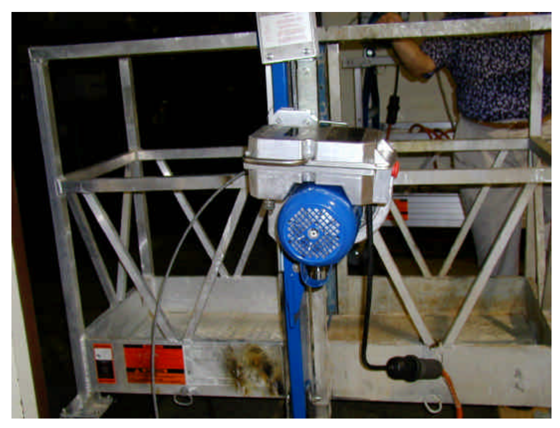
Figure 1 - Side view of Compact hoist mounted on Walk-Thru stirrup of MKD Work Cage.