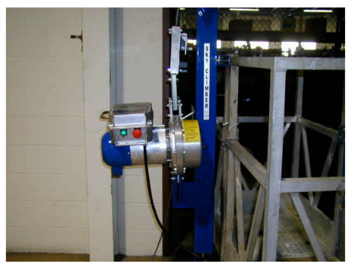
Figure 3 - Front view of Compact hoist mounted on Walk-Thru stirrup of MKD Work Cage.