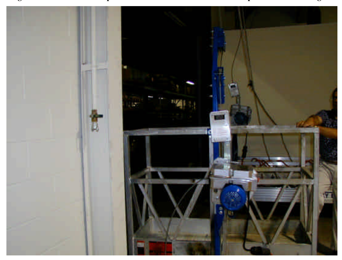
Figure 2 - Complete side view of Compact hoist mounted on Walk-Thru stirrup of MKD Work Cage.