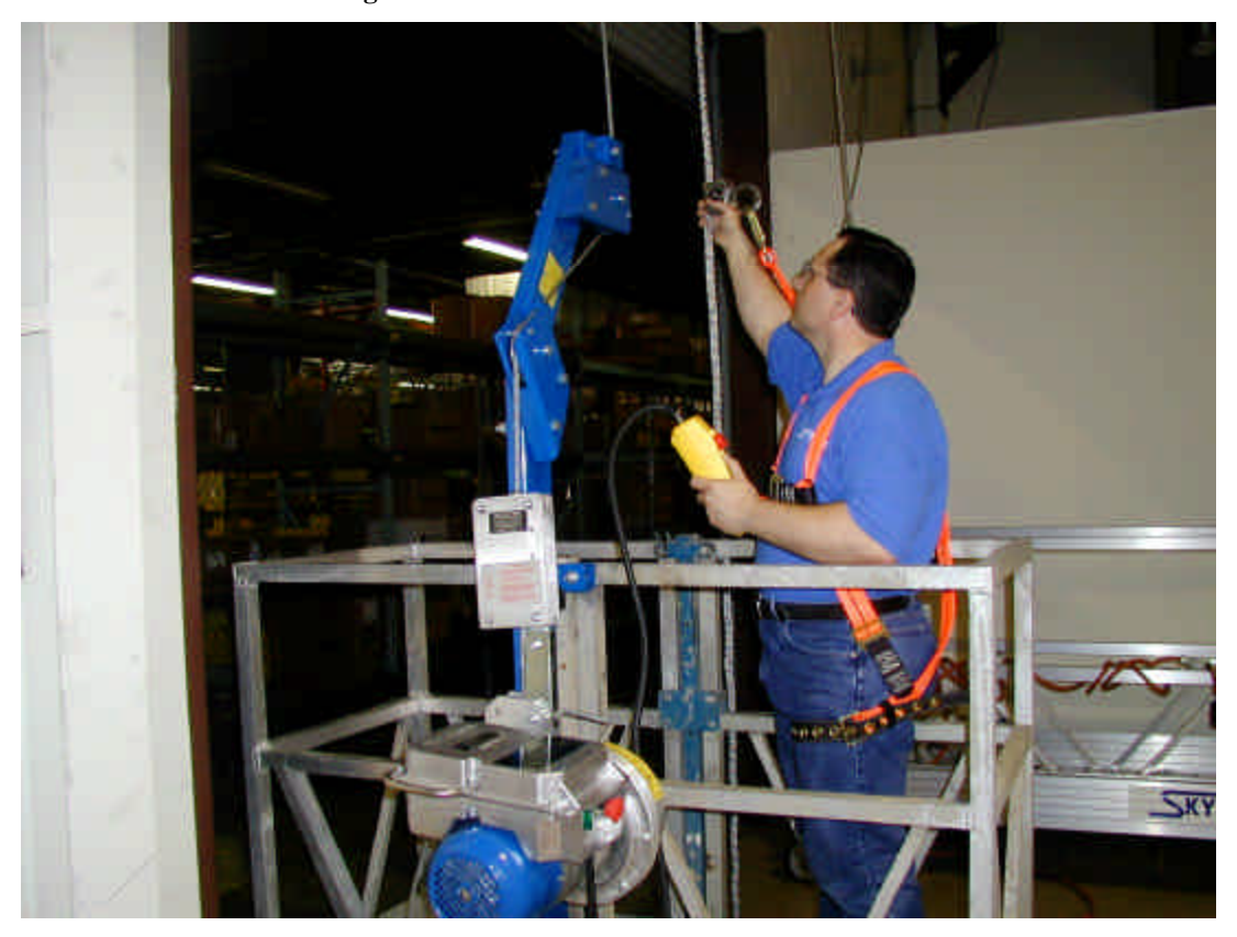
Figure 10 - Operator using the optional pendant controls of Compact hoist mounted on Walk-Thru stirrup of MKD Work Cage.