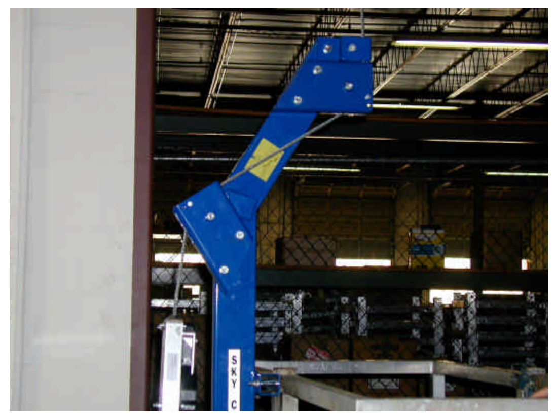
Figure 6 - Close-up view showing routing of wire rope through stirrup and into hoist. Path of wire rope is through top of stirrup, under top pulley, over bottom pulley, through sky lock, and into hoist.