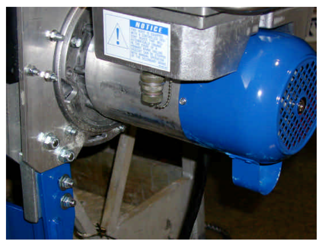
Figure 7 - Close-up back view of Compact hoist mounted on Walk-Thru stirrup of MKD Work Cage.