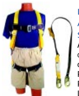
Light Body Harness & Attached High Profile Shock Absorbing Lanyard A favorite Harness/Lanvard combination now available in one convenient package. Part No. 310029 Harness and Part No. 310259 Shock Absorbing Lanvard.